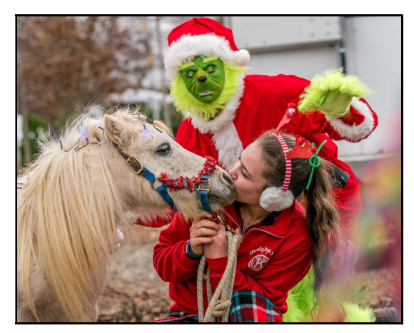
Where's the mistletoe? The Grinch tried to steal Christmas, but instead this local equestrian stole a kiss!