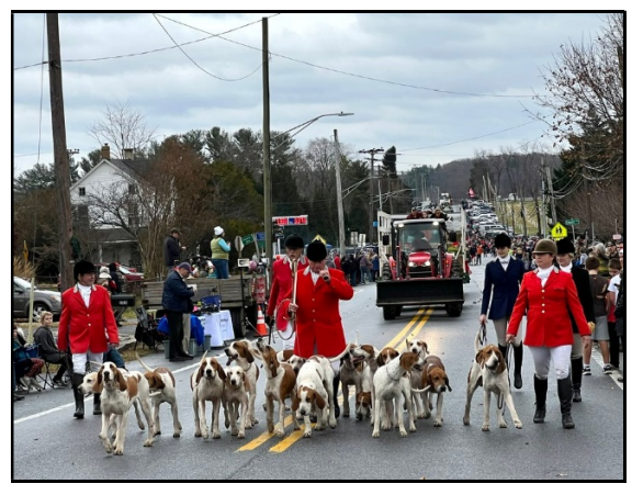
The Goshen Hounds once again steal the show at The 2021 Great Lisbon FARMERS FEED THE HUNGRY Christmas Parade!

Who will lead the 2022 parade to kick off on Saturday, December 10 at 12 noon in our historic Town of Lisbon, Maryland? Stay tuned! We'll announce that in early 2022!