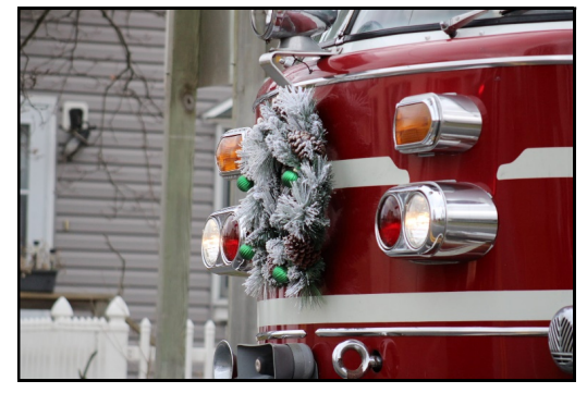
Festive Antique Fire Truck from Circle D Farm.

Sunday; Farmers and Hunters Feeding the Hungry and the Lisbon Volunteer Fire Company!