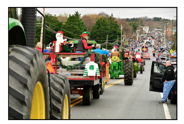
Fully Lined Parade Route

In keeping with the spirit of the season, the Howard County Farm Bureau challenged the Carroll County Farm Bureau to "BRING IT ON" – whichever farm bureau had more tractors in the parade in 2021 gets to lead the parade with their banner in 2022! Both Howard County and Carroll County farm bureaus were well represented!