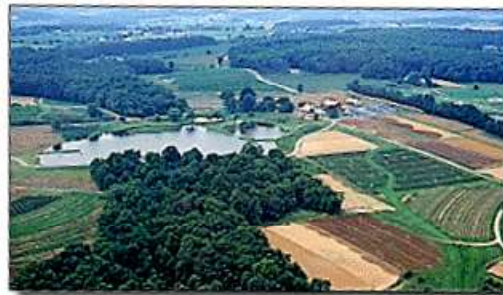
Aerial View of Larriland Farm

The prefix that he chose was Larri-, hence, the name Larriland Farm (pronounced Larry land).