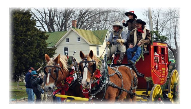
Saturday, December 14, 2019