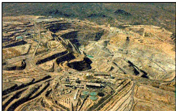
Open-Pit Viewpoint on the south rim of the Mission Mine

The Company is a fully integrated miner, smelter and refiner of copper in the United States. ASARCO's domestic mines annually produce approximately 350 – 400 million pounds of copper. Significant copper mines include the Mission, Silver Bell and the Ray open-pit mines, all three in Arizona.