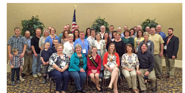
More than 50 MFB members gather in Orlando.